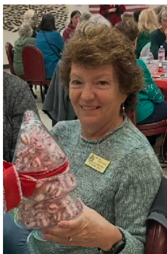
Lucky winners at the holiday party.