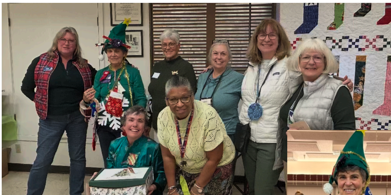
Winning team of the Dress The Tree contest at our Holiday Party.