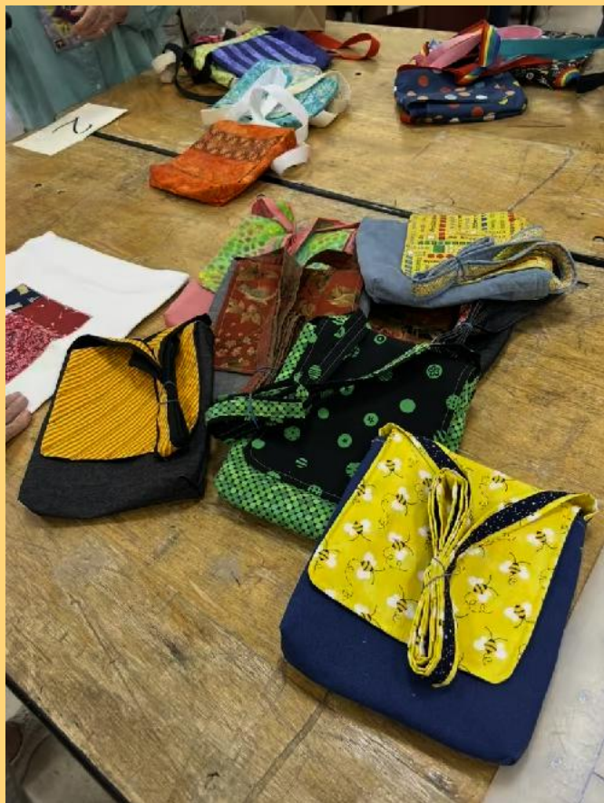
Many Sew Powerful Bags were made!

Ponderosa Community Center 17103 Ponderosa Way. Brownsville, CA. September 3, 6, and 7th, 10:00-4:00