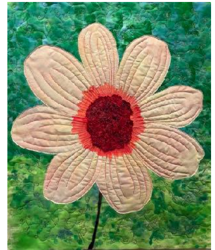
Samples for the Art Quilting Class at Jamboree