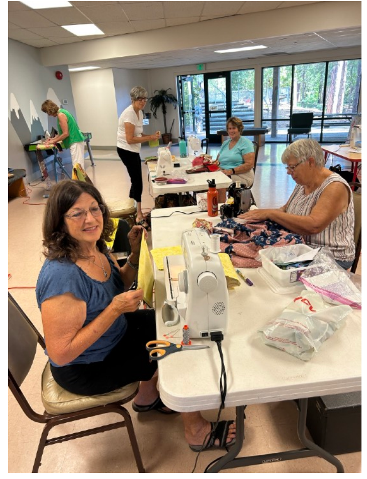
Sew Day 2023 at Sierra Presbyterian Church