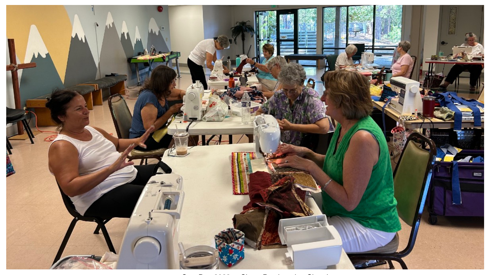
Sew Day 2023 at Sierra Presbyterian Church