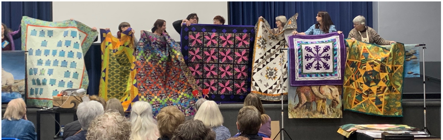
Above: Quilts from the 2022 Holiday Challenge