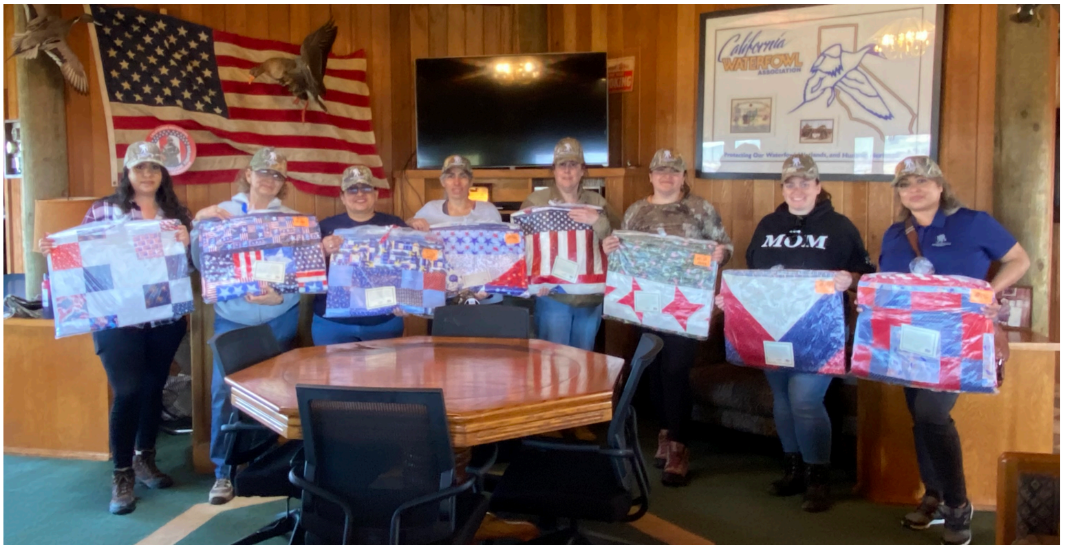
First distribution of Wound Warrior quilts on February 10